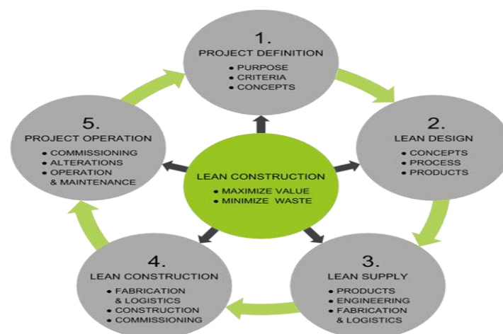
Fig. 1 Application of Lean construction Quinn and Ulla Thorne, [14, 15, 16 & 17]

Lean improvement is a blend of useful investigation and sober minded improvement in plan and advancement with an adaption of lean collecting norms and practices to the beginning to end plan and advancement process. Not at all like collecting, improvement is an endeavor based creation process. Lean Construction is stressed over the course of action and complete mission for concurrent and tireless updates in all parts of the created and normal environment: plan, advancement, establishment, support, saving, and reusing [11, 12 & 13]. This approach endeavors to manage and additionally foster improvement processes with the lowest cost and generally outrageous worth by considering client needs [3 & 5]. This result is created when standard development approaches are converged with a reasonable and succinct comprehension of undertaking materials and data and two arrangements of the executive's originals, arranging and control. This might appear to be perplexing to comprehend, however the substance of this framework is to utilize what is vital without extra. This must be finished by essential preparation and activity by an administration bunch and with the assistance and help, everything being equal.